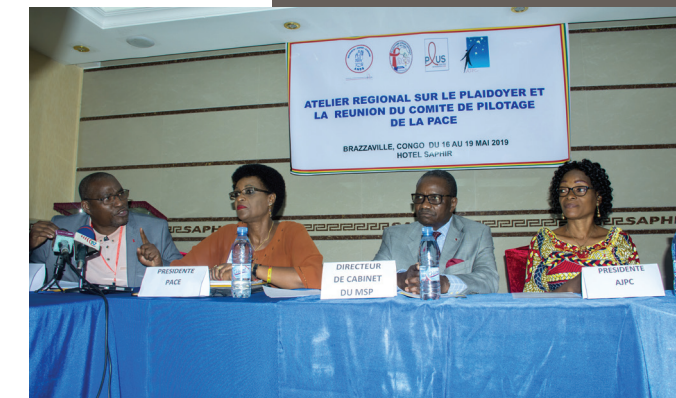
Advocacy workshop organized by the PACE

A solidarity-based public financial institution, AFD is the central stakeholder in France's development policy. It is committed to projects that tangibly improve the daily lives of populations in developing and emerging countries and in French Overseas Territories. Present in 109 countries via a network of 85 agencies, AFD currently supports over 4,000 development projects. In 2018, it committed 11.4 billion euros of funding to these projects. Find out more at: www.afd.fr