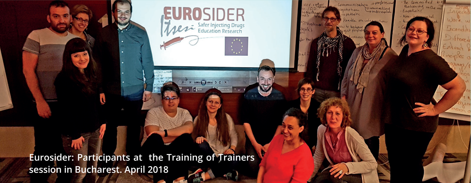
Eurosider: Participants at the Training of Trainers session in Bucharest. April 2018

PROMOTE COMMUNITY OUTREACH through mobilisation and capacity building, community-based research and advocacy.