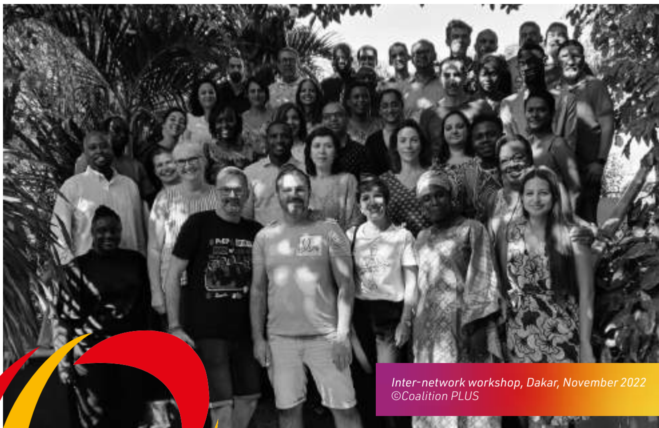
Inter-network workshop, Dakar, November 2022

Created in 2008, Coalition PLUS is a global network of community-based organizations dedicated to fighting HIV/AIDS and viral hepatitis, with a strong commitment to the rights and health of individuals most affected by these epidemics.